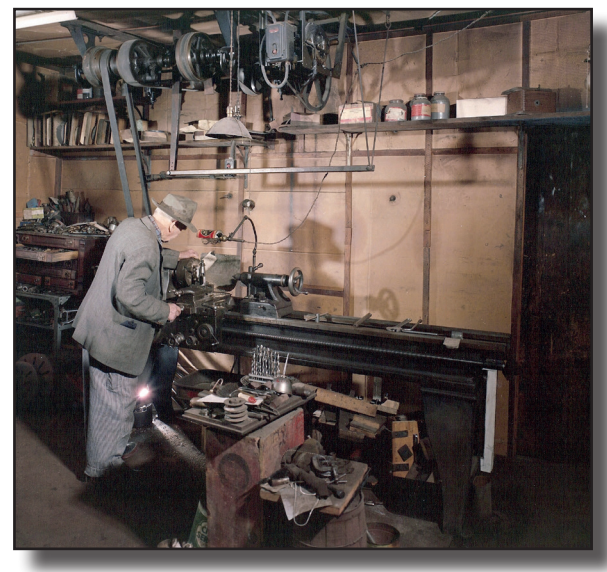
Replica of R.I. Anderson Machine Shop on East State Street from around 1930 to 1970.

In addition to crafting the custom-made brass and bronze specialty apparatus required for outfitting the fire trucks, Anderson cast, machined and sold other fire-fighting equipment for manufacturers to use.