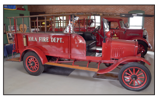
Model T Engine